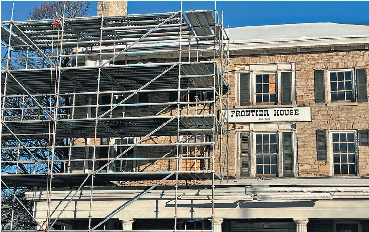
Pre- and post-snowstorm, construction crews have diligently worked to repair the exterior of the Frontier House in Lewiston.